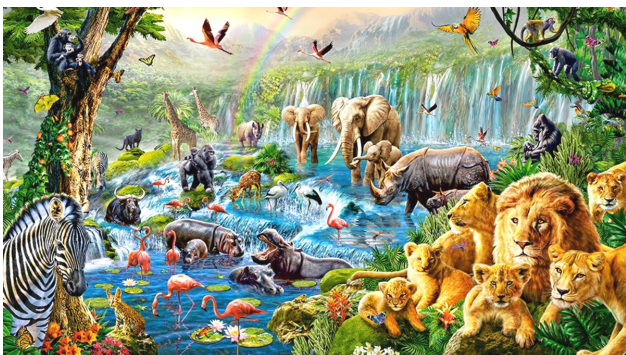
Nature used to be in perfect harmony before sin entered the world.

Environmentalism is the new religion that unites humanity with the natural world. It is being promoted everywhere. It is in the public schools and in the entertainment industries. It is found throughout society and even in the churches. The climate change message has become the basis for the new universal push for pantheism – a philosophy that equates God with nature.