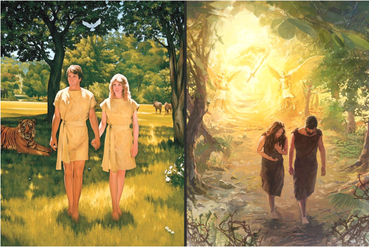
God’s perfect creation was marred by sin.

was made subject to vanity, not willingly, but by reason of him who hath subjected the same in hope, because the creature itself also shall be delivered from the bondage of corruption into the glorious liberty of the children of