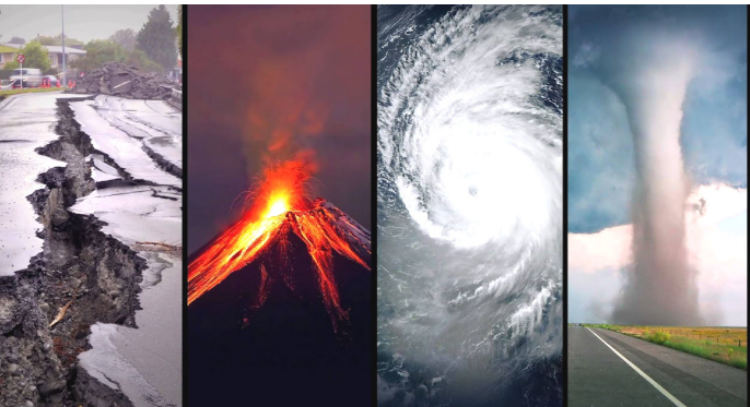
Nature is beautiful and awe-inspiring. It can also be brutal and merciless.

Our climate systems also changed as all of nature came under what the Bible calls a “bondage of corruption.” “For the creature (creation)